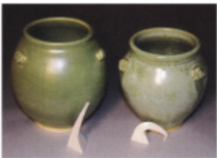
Some glazes look okay when underfired a little (on left), but create different effects when reaching their full temperature. (Sample Amaco glaze photos from Arts & Activities magazine, February 2015)